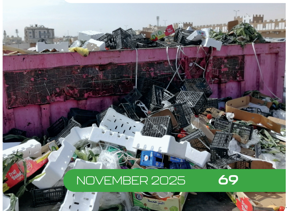
Mixed MSW in Al Ahsa in 2024.

The second is to source local SCM to reduce the clinker factor while minimising transport emissions and costs. While there is no fly ash – and very little slag – produced domestically, there are extensive