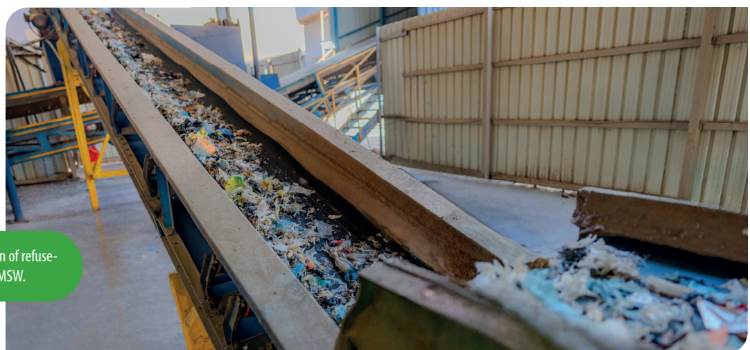
City Cement uses a large proportion of refuse-derived fuel (RDF) produced from MSW.